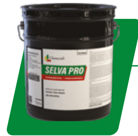
2K acrylic sealer for wood application